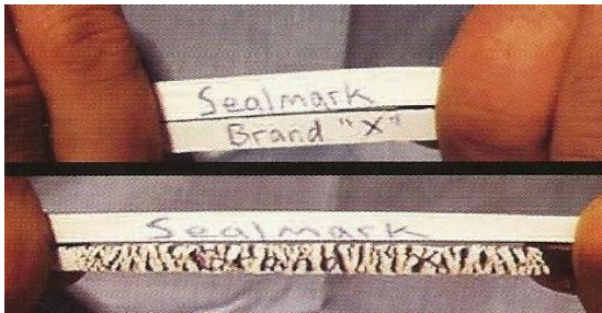
Sealmark Expands and Remains Bonded to Substrate

Restoration coating is far superior to other waterproof products and paint solutions. This space-age, specially formulated, Fortified acrylic compound helps to reduce utility costs. Sealmark Coatings has Solar Reflectance of 95% and acts as a thermal barrier to provide greater energy efficiency. Restoration Coating can be applied to virtually any surface from existing stucco to glazed brick, rubber, cured concrete, wood, metals or other structurally stable or painted substrates. Over 900 colors available. The Superior properties allow Restoration Coating to adhere and maintain surface integrity allowing it to handle the stresses of subtle building movement and temperature changes.